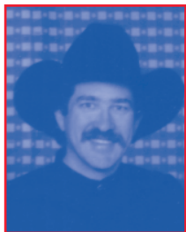
KIX BROOKS - 1997 Inductee

Born and raised in Shreveport, Kix Brooks was influenced by a variety of regional musical styles ranging from Cajun to blues to jazz to country. He was first inspired towards a musical career by his neighbor, legendary country recording artist Johnny Horton.