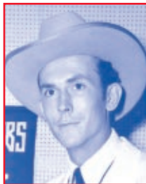
HANK WILLIAMS - 2004 Inductee

Although he died in 1949, Ledbetter's musical achievements continue to be recognized. In 1988 he was inducted into the Rock and Roll Hall of Fame.