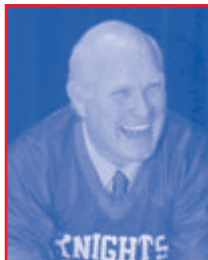
TERRY BRADSHAW - 2005 Inductee