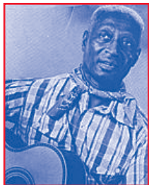
HUDDIE LEDBETTER - 2004 Inductee

Huddie Ledbetter, known by the nickname Leadbelly, was born near Mooringsport, Louisiana in 1889 and overcame poverty and many other hardships to become a pioneer folk singer and musician. His musical achievements helped pave the way for other musical styles such as blues and rock and roll.