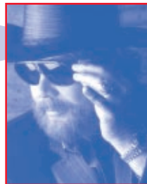
HANK WILLIAMS, JR. - 2004 Inductee

Williams was one of the first inductees into the Country Music Hall of Fame in 1961, and although his career was short, his impact on the music industry is still being felt today.