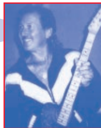
JAMES BURTON - 1999 Inductee